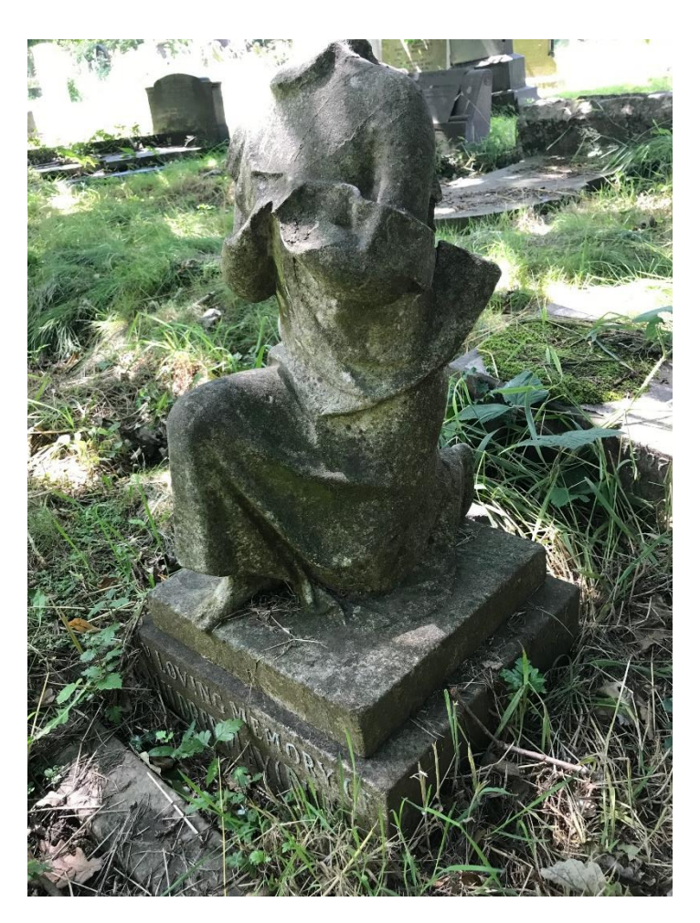
One little angel

A search around the actual churchyard and then a search through the parish records did not come up with any obvious answers. We did have a headless angel, although she looked to be made of stone and not marble, and an Art Deco angel on a headstone. Neither of them, however, fitted the description in the poem and still don't.