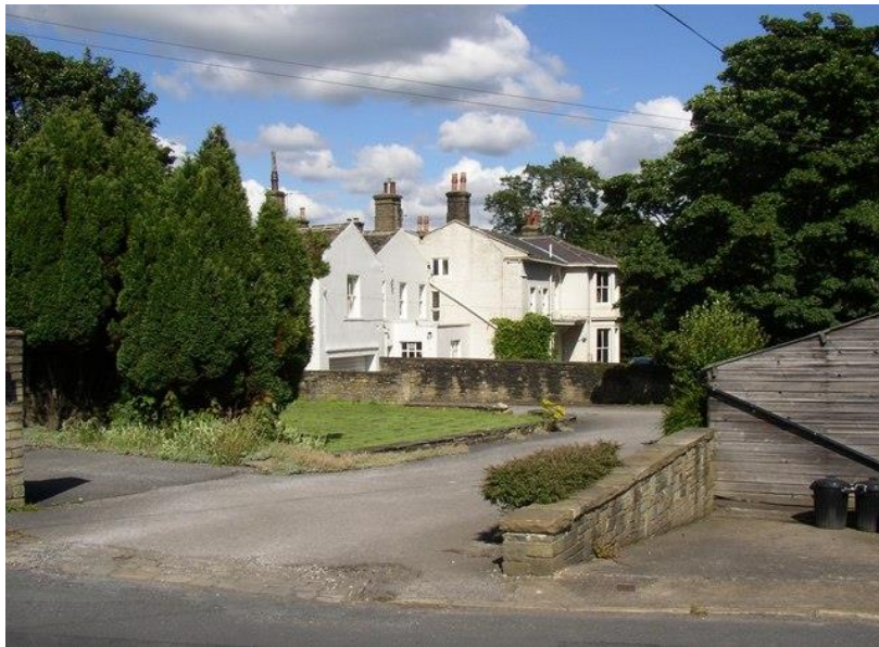
Holroyde House, Priestley Green