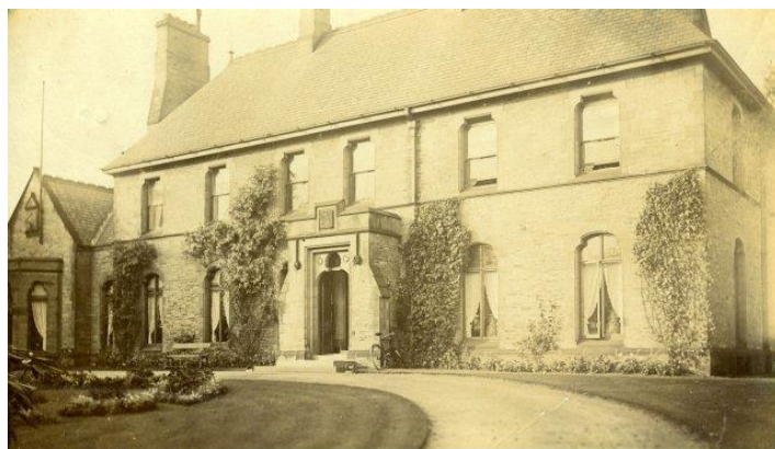
The Grange Lightcliffe