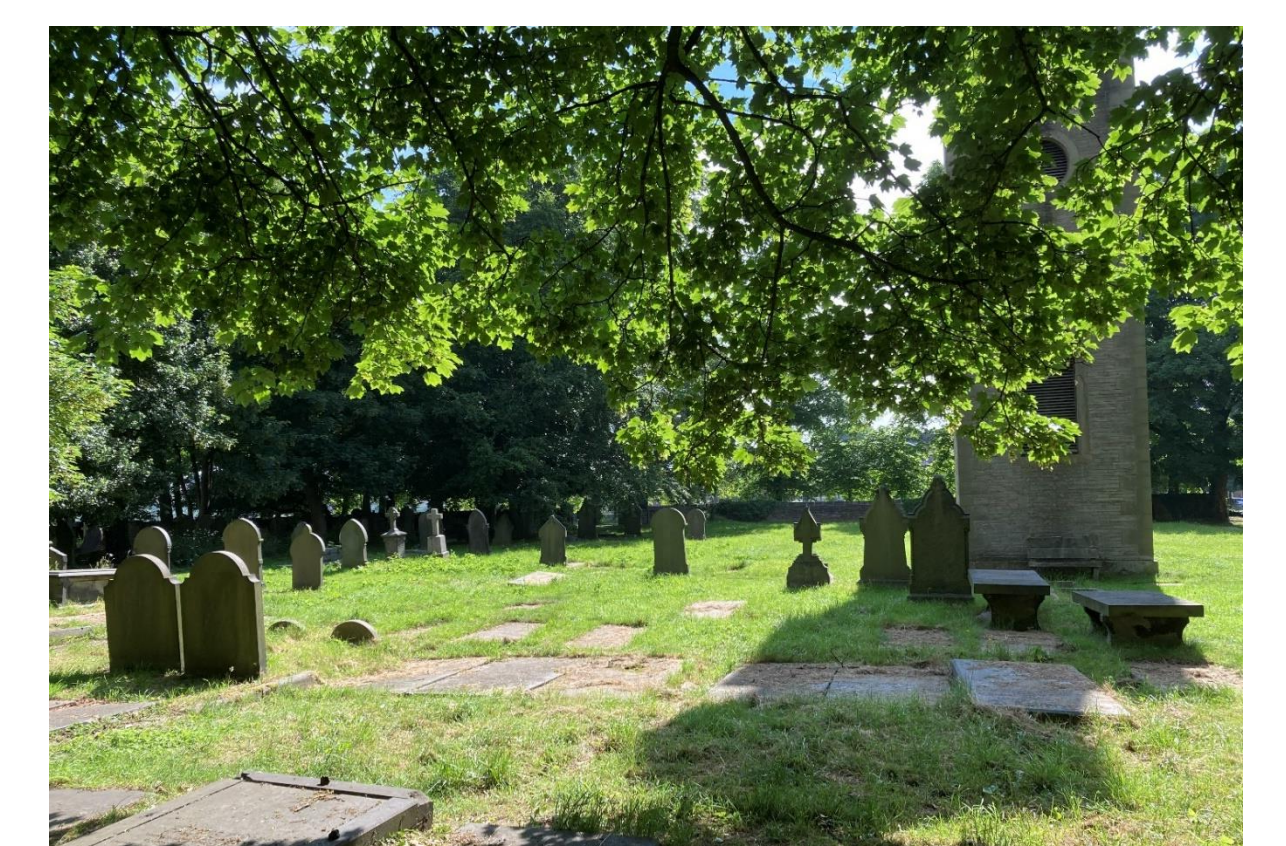
The Macaulay family of Slead Hall

The row of flat ledger stones below belongs to members of the Macauley family originally from Slead House. But two of the six stones are blank – the first and third from the left. Were members of the family buried in these plots? Have their chest or table tombs been removed? Possibly, read on and then read:-