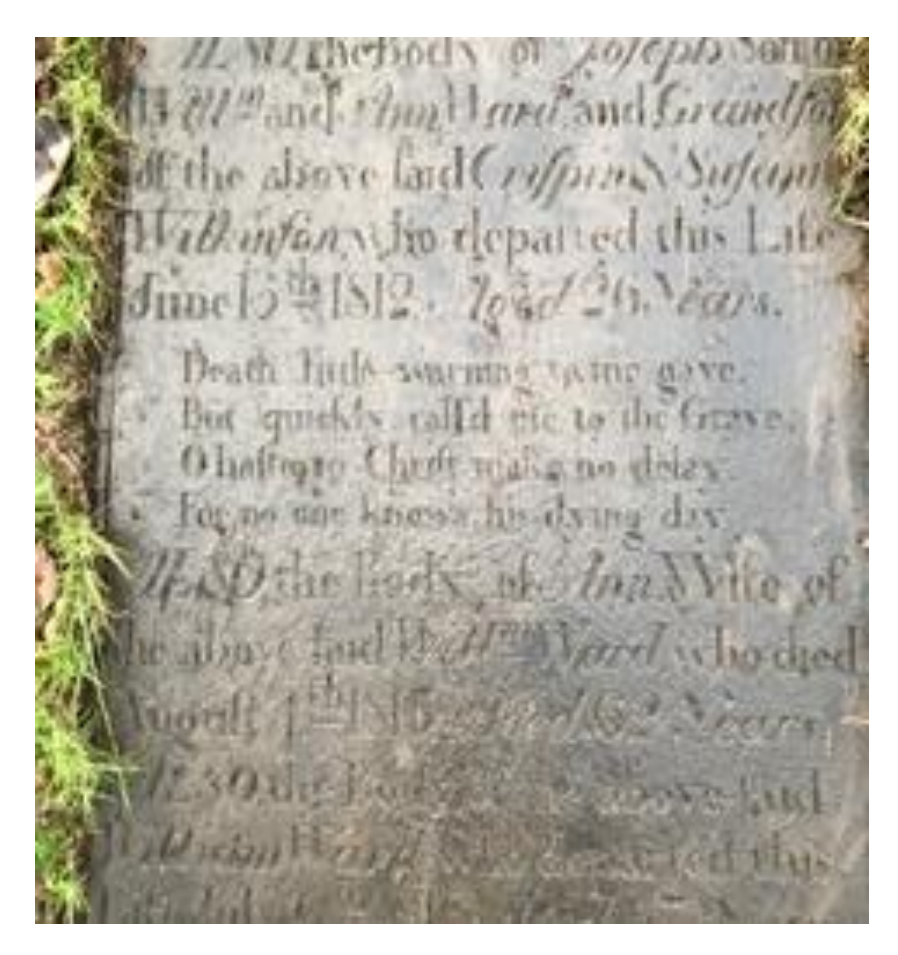
Above the bottom part of the memorial on plot S*25, Below before and after images after the moss was cleared.